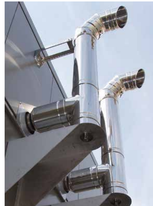
Exhaust silencing and discharge systems