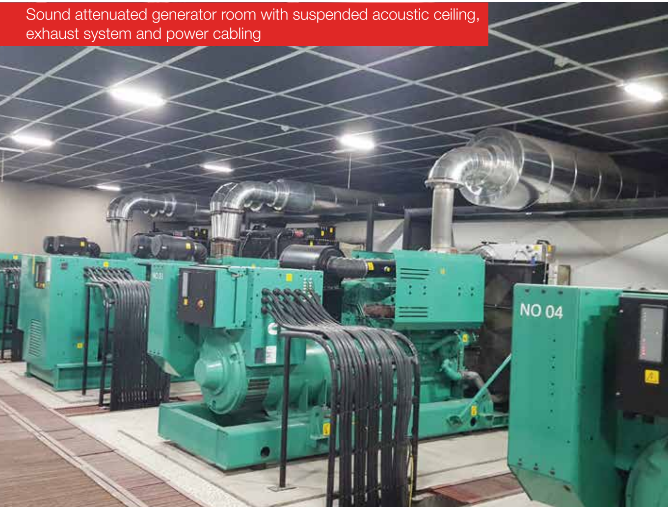
Sound attenuated generator room with suspended acoustic ceiling, exhaust system and power cabling