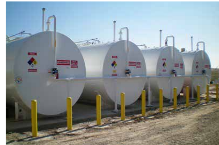
Fuel storage tanks and automatic level control systems